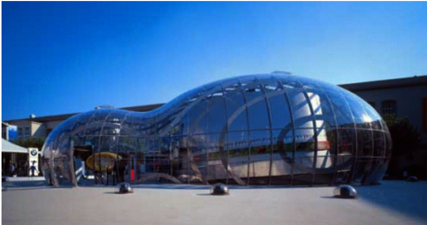
Figure 1. Isomorphic architectures: Bernard Franken's BMW Pavilion in Munich.

architectures), motion kinematics and dynamics (animate architectures), keyshape animation (metamorphic architectures), parametric design (parametric architectures), and genetic algorithms (evolutionary architectures), as discussed in (Kolarevic 2000). New categories could be added to this taxonomy as new processes become introduced based on emerging computational approaches. For examples, new methods could emerge based on performance-based (structural, acoustical, environmental, etc.) generation and transformation of forms.