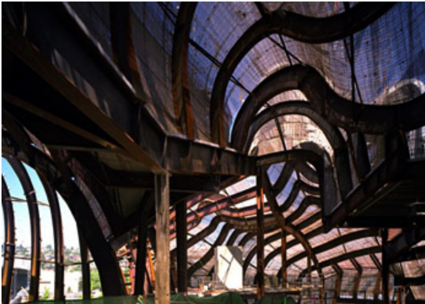
Figure 2. Structural frames in Frank Gehry’s Experience Music Project in Seattle, produced by contouring.

As its name implies, subtractive fabrication involves removal of specified volume of material from solids using multi-axis milling. In CNC (Computer Numerical Control) milling a dedicated computer system performs the basic controlling functions over